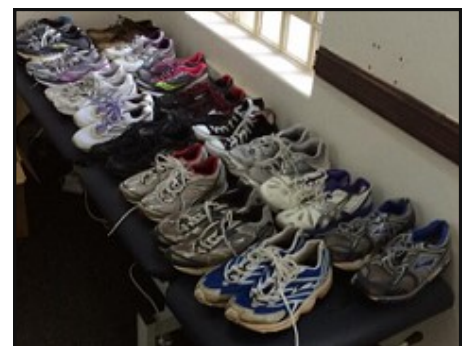
An assortment of shoes ready to pass on to homeless persons in Melbourne at cohealth