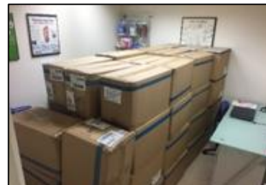
(Below) The wealth of socks donated by Hanes awaiting pick up at the Ivanhoe Podiatry Centre.