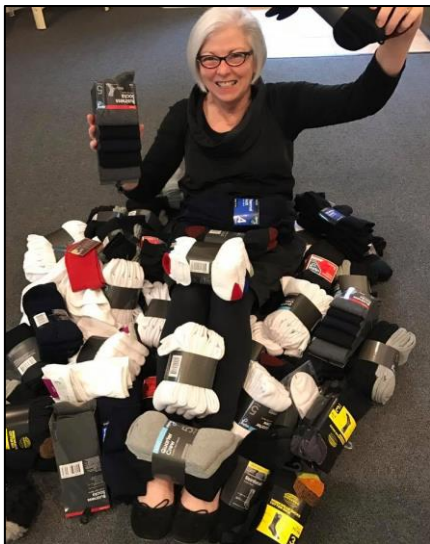
(Left) Langmore Podiatry contributed 400 pairs to the Sock It To 'Em project.

At the same time Sock It to 'Em facilitated an astonishing 3,967 new pairs of socks for distribution through project affiliate organisations. Numerous Podiatry clinics have concurrently participated by serving as Sock Collection Points for supporters to donate. Footscape equally acknowledges Hanes for their incredible donation of socks to this project.